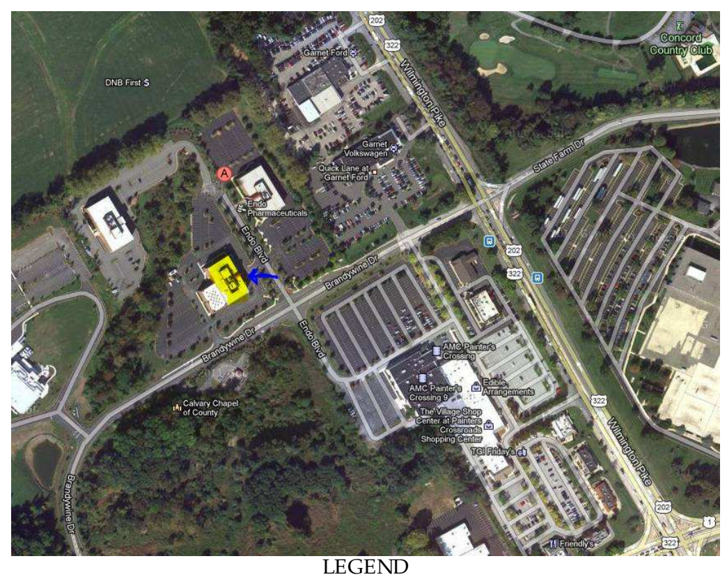
The yellow highlighted building, is building one, the location of our meeting.

100 Endo Boulevard Chadds Ford, PA 19317 (610)558-9800