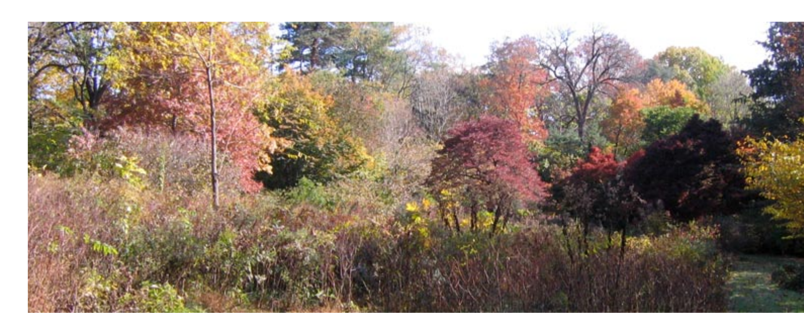
Taylor Arboretum at Widener University is a 30 acre reserve of plantings and natural lands

Go to first traffic light and turn right onto E 14th St. into the main entrance of the university.